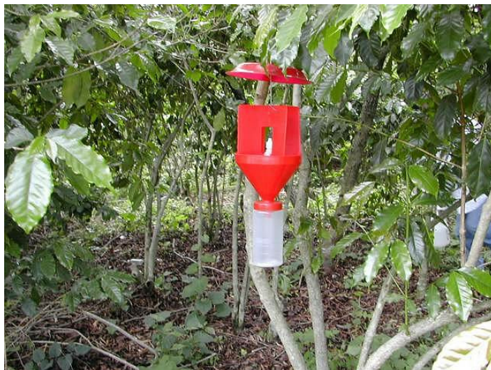
Fig. 2: Trap installation

It is not necessary to collect fallen fruits off the ground, a practice known as "pepena" or "junta" in Central America. Trapping takes care of capturing and killing any CBB emerging from such berries.